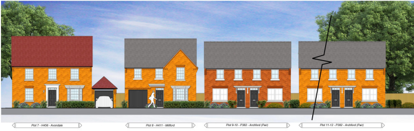
STREET SCENE F-F.....cont