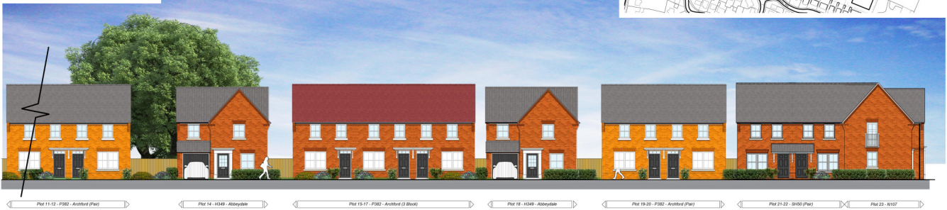
STREET SCENE F-F